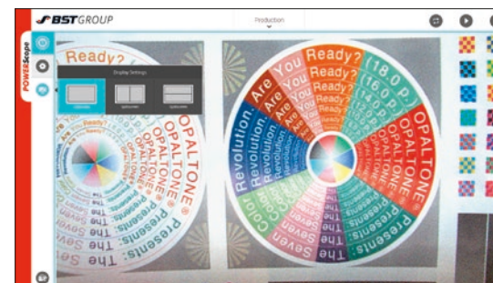
The intuitive POWERScope 5000 touch screen user interface "Production Display Settings Menu".

POWERScope 5000 is fully mechanically compatible with the POWERScope 3000 and POWERScope 4000 predecessor systems without the need for any press frame modifications.