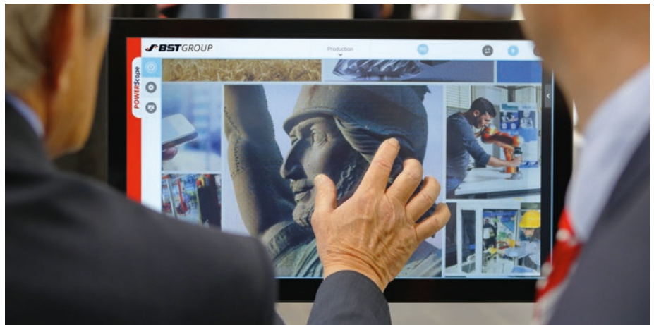
The intuitive POWERScope 5000 touch screen user interface "Production Position List"

monitor in a user-friendly way and tops the user concept off.