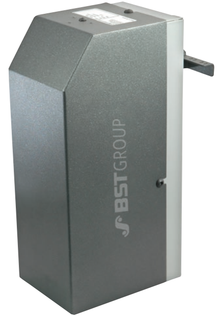
Camera unit of the POWERScope 5000

Just like its very successful predecessors, the new POWERScope 5000 meets the established criteria: excellent value for money, simple operation, robustness and reliability.